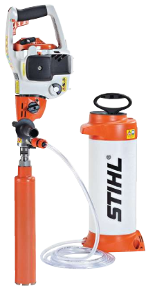
BT 45 with core drill adapter and water tank shown.

Ideal for mass flower plantings or deep root fertilization, the compact BT 45 earth auger drill helps users work through large amounts of soil quickly with less fatigue.